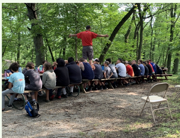
The director giving a keynote at Chi Rho.