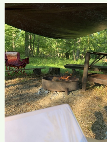
Chi Rho cooking facilities.