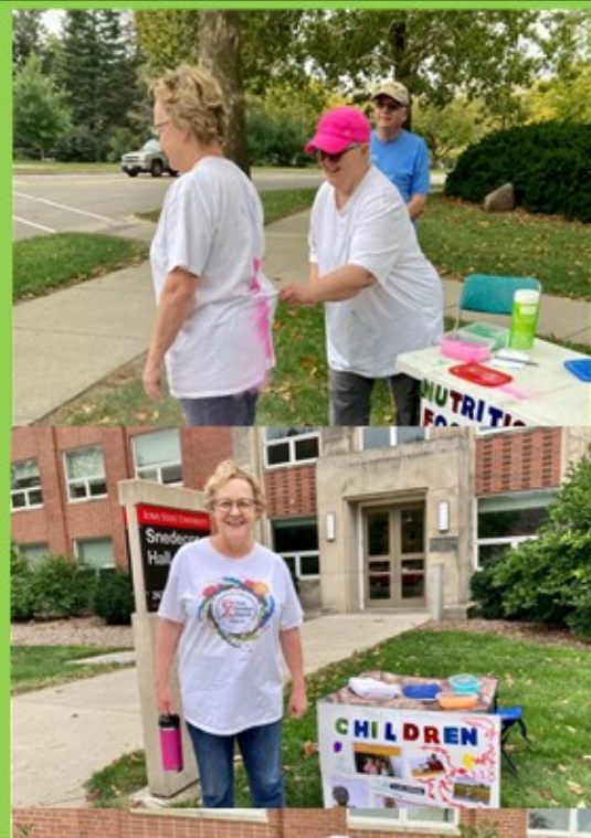
Crop Walk, October 10 2021