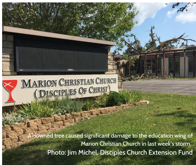
A downed tree caused significant damage to the education wing of Marion Christian Church in last week's storm.