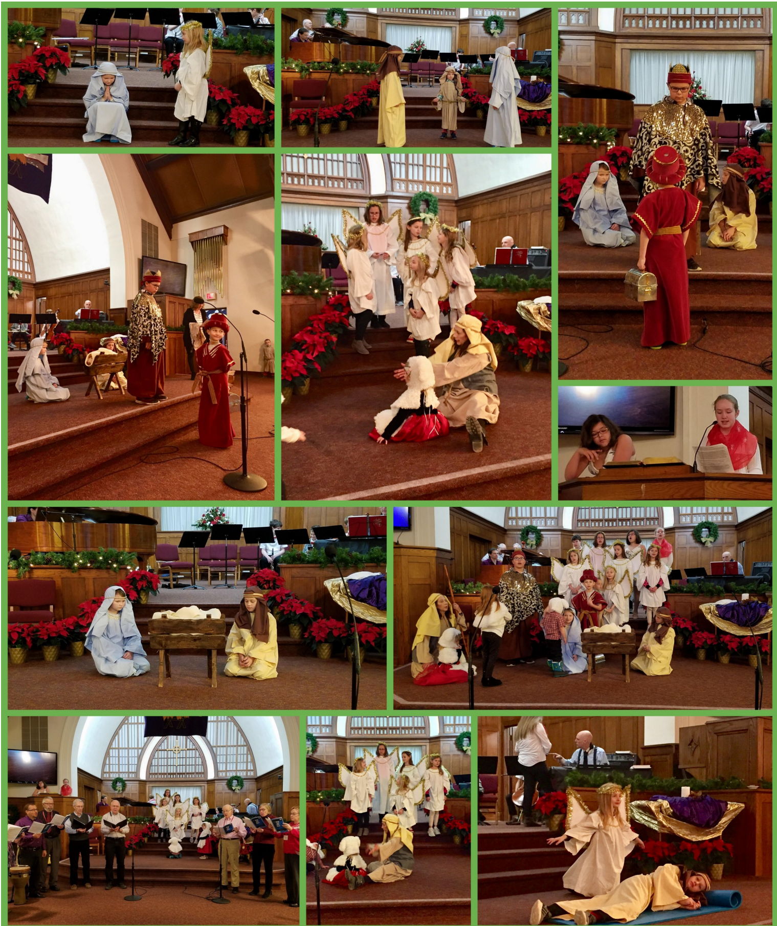
FCC Children's Christmas Pageant, December 15, 2019