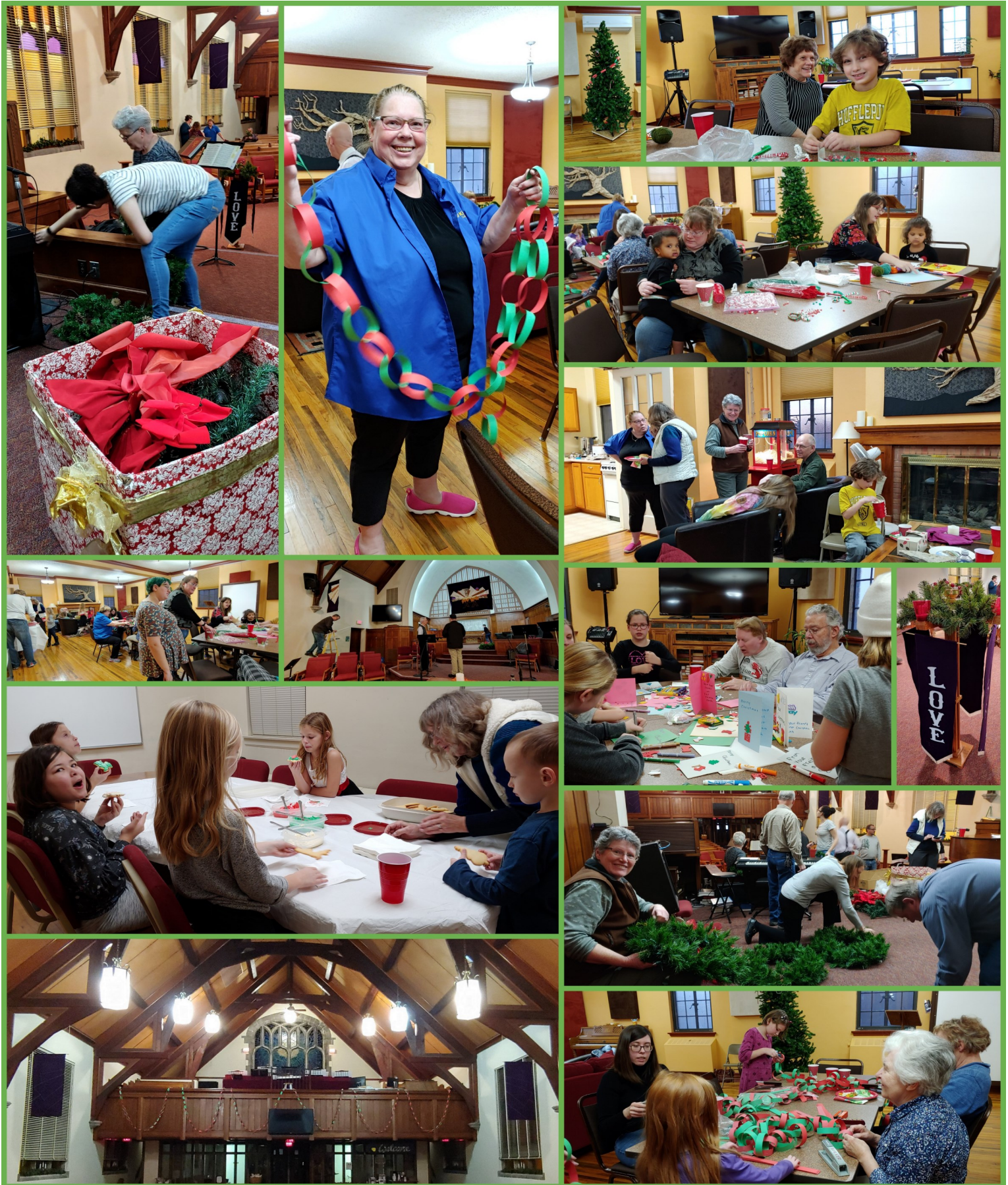
Hanging of the Greens Party, Sunday, November 24, 2019