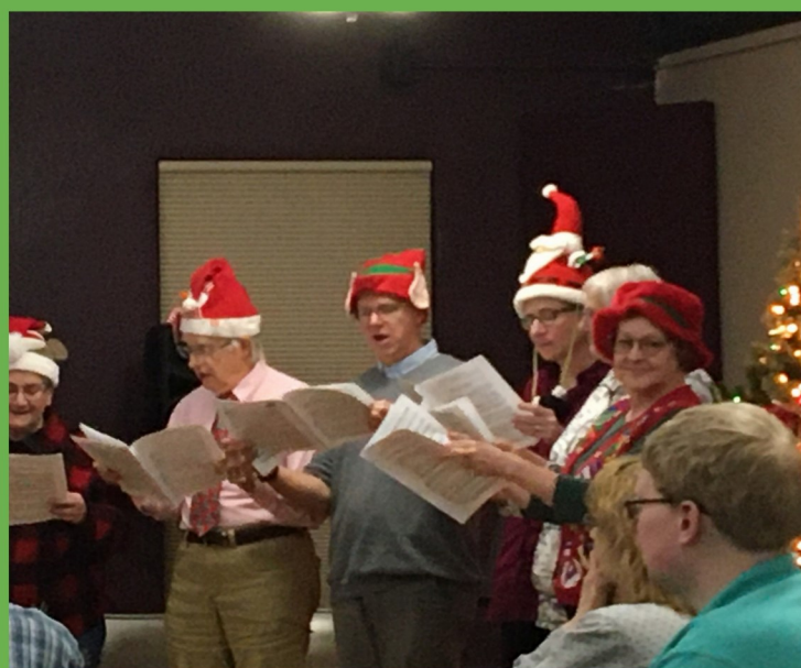
FCC Singers, Christmas Party, December 11, 2019